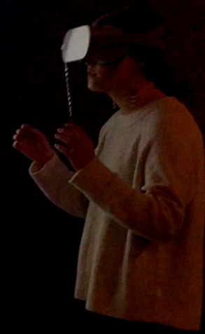
Meta.Morf X – Digital Wild, Trondheim Electronic Arts Centre (Trondheim, Norway) 2020